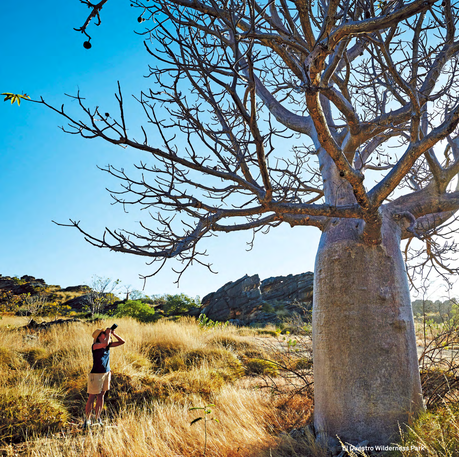
El Questro Wilderness Park