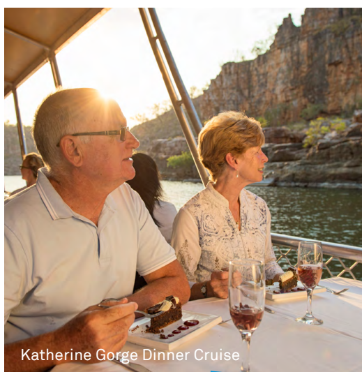
Katherine Gorge Dinner Cruise

Let the Mystical Kimberley share its many stories with you as you journey into the heart of this incredible region. Stay overnight in the Bungle Bungles and discover ancient lore and generations of stories.