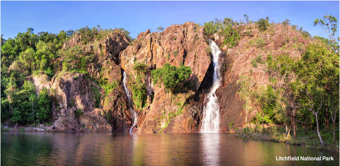
Litchfield National Park

To find out more visit scenic.com.au, call 138 128 or contact your nearest Scenic Agent