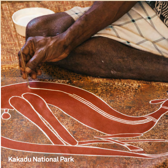
Kakadu National Park

Your Special Stay will immerse you in the 350-million-year-old Bungle Bungle Range at the Bungle Bungle Savannah Lodge. You will find one of the best stargazing spots in Australia complemented by a refreshing pool, chef-prepared meals and comfortable, private cabins designed to blend with the landscape of Purnululu National Park.