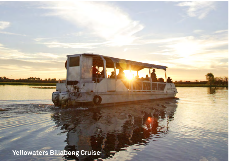
Yellowwaters Billabong Cruise